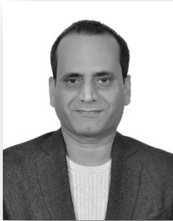
Founder & CEO LL.b, B.Com