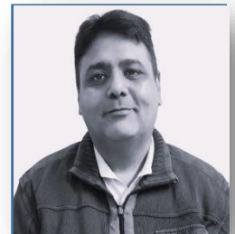
Head – Reporting and Analytics FCA, B.Com